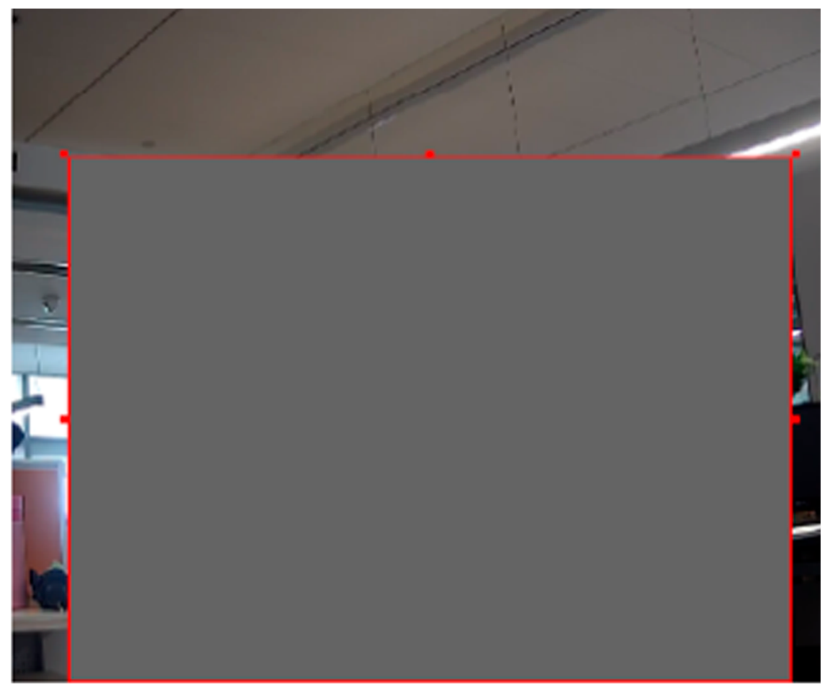
Figure 8-1 Set Video Tampering Area