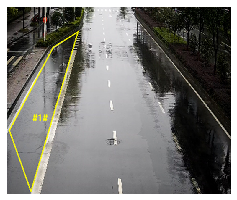
Figure 8-4 Draw Area