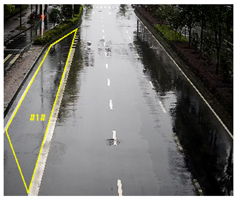
Figure 8-5 Draw Area