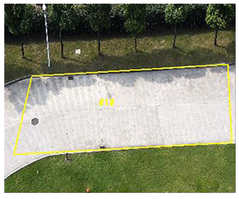
Figure 8-2 Draw Area